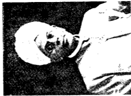
The Hon. Sir Ponnambalam Ramanathan, Kt., K.C., C.M.G.