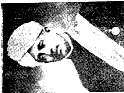
The Hon. Sir Ponnambalam Arunachalam, Kt.